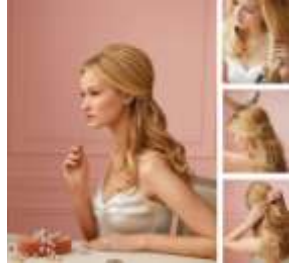
Bridesmaid: Bridesmaid Hairstyle: Make-Up: